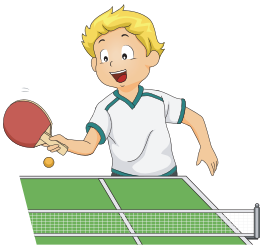
table tennis running